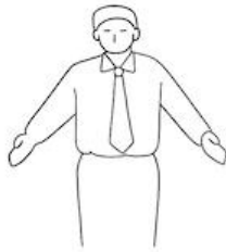
MOTONOICHI Take your positions