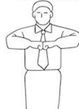
AIUCHI Simultaneous Techniques