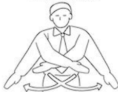
TORIMASEN No Score