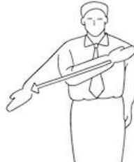
WAZA ARI Effective technique