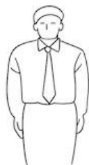
HAJIME Start (KUMITE)