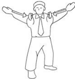
TSUZUKETE HAJIME Restart match