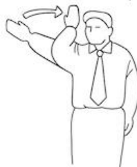
FUKUSHIN SHUGO Calling one Judge