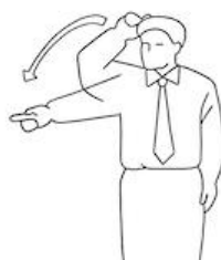
JOGAI Out of Area