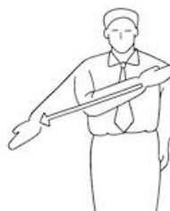
WAZA ARI Effective technique