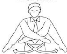
TORIMASEN No Score