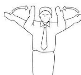
FUKUSHIN SHUGO Calling all Judges