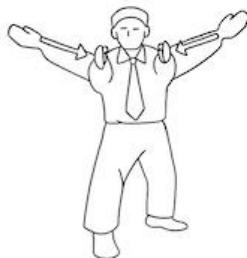
TSUZUKETE HAJIME Restart match