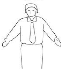
MOTONOICHI Take your positions