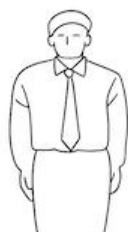
HAJIME Start (KUMITE)