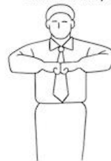
AIUCHI Simultaneous Techniques